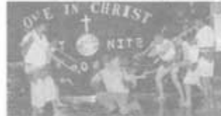
1 st year students