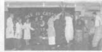
4 th year students