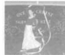
Ballerina from Jeremiah School