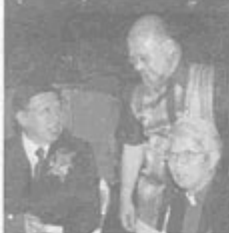
A time of fellowship among our guests