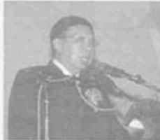
Inspirational words from our Guest of Honour, Y.B. Dato' Sri Law Hieng Ding