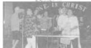
2 nd year students