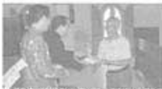
Presentation of certificates to the students