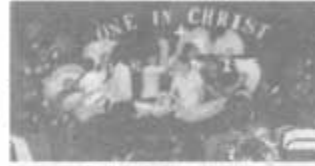
Fun Dances by 1 st year students

第四年生脱颖而出，成为全场冠军。评判员也嘉赏学员们，希望他们在事奉上也同样有此创意。