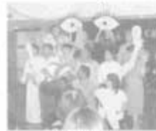
3 rd year students