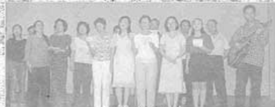
Presentation by the students

马来西亚神学院于二零零四年二月十五日在怡保举行了地区性的廿五周年院庆，在同一个时候，怡保神学延伸中心也举行五周年纪念庆典。八位讲师于当日到过十一间堂会，十六个崇拜主持礼拜。院庆与感恩崇拜被安排在怡保圣约翰堂举行。我们为著上帝在过去廿五年对学院的信实感谢神。接著便是颁发八十二张证书给怡保神学中心毕业生，他们都在过去两年参与延伸中心的课程。我们在此向黄满兴法政牧师、凌玉明牧师及所有在这次院庆背后支持与帮助的弟兄姐妹们至于万二分的谢意。