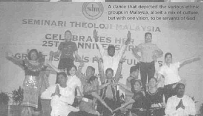
A dance that depicted the various ethnic groups in Malaysia, albeit a mix of culture, but with one vision, to be servants of God