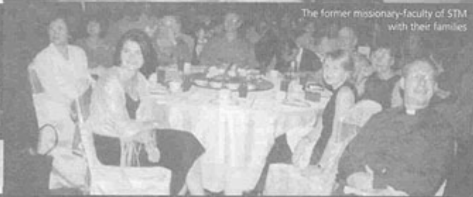
The former missionary-faculty of STM with their families