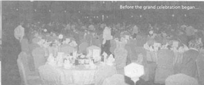
Before the grand celebration began...