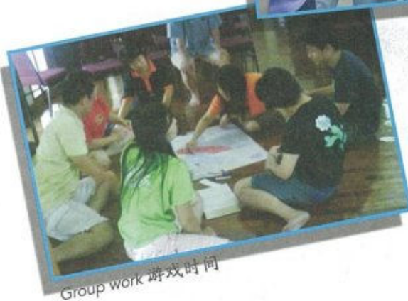
Group work 游戏时间