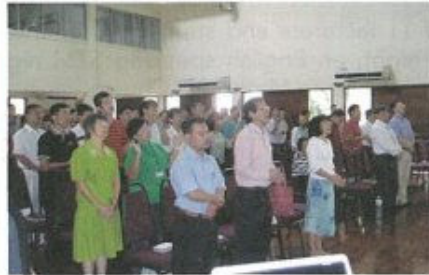
Attended by students & lecturers 全体师生一同参与退修会