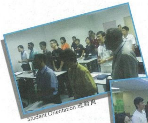
Student Orientation 迎新周

感谢神，今年我们共有27位全日制新生。他们已在1月4日，即迎新周前夕报到。学长们除了欢迎他们的到来，也帮助他们安顿下来，因为当中不乏第一次远离家乡的新生。四天的迎新周旨在帮助新生认识和适应学院的设施、组织和环境。学院安排代院长、各讲师和同工为新生讲解学院的各层面，包括生活守则、院规、实习教育指南和图书馆规则等。此外，学院也安排他们出外购物、与讲师和学长进行保龄球赛和其他轻松活动。迎新周以火锅晚餐开始，新生、讲师和他们的家人共聚一堂，彼此分享和认识。