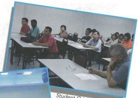
Student Orientation 迎新周