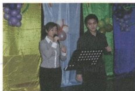
Emcees for the night 当晚的领会