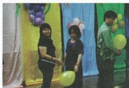
Ice-breaking game 破冰游戏