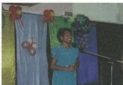
1st year student introducing herself 新生自我介绍