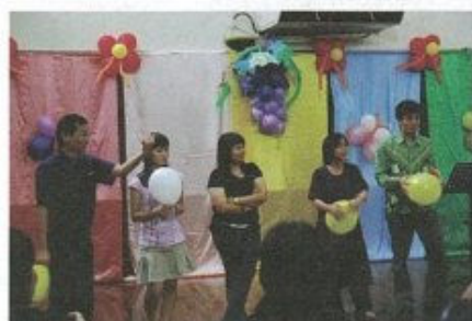
Ice-breaking game 破冰游戏