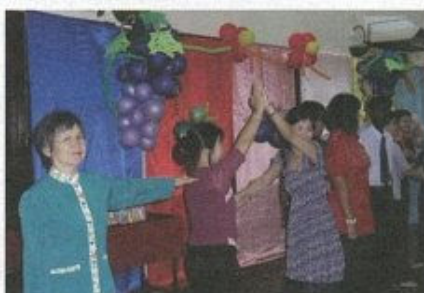
Ice-breaking game 破冰游戏