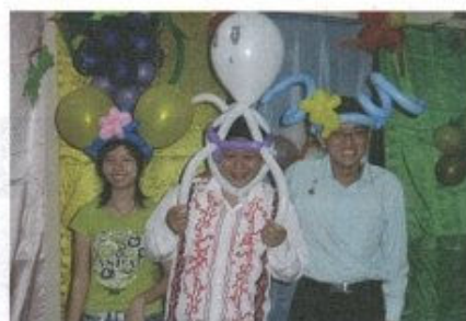
Games for 1st year students 新生游戏时光