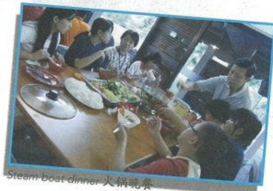
Steam boat dinner 火锅晚餐