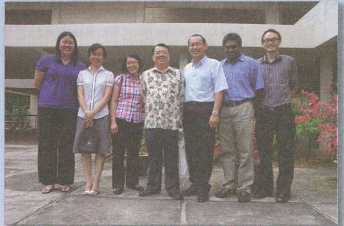
Alumni who were interviewed by the Accreditation team.