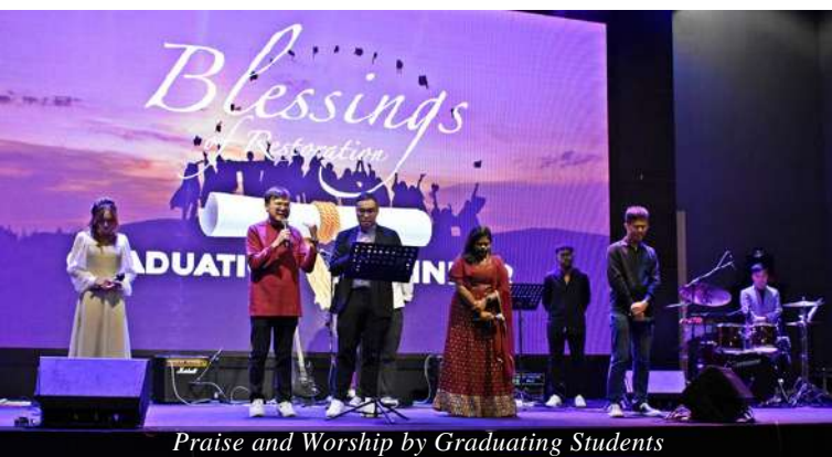
Praise and Worship by Graduating Students

The journey of organizing the STM Graduation Dinner 2023, themed "The Blessings of Restoration" (Colossians 1:19-20), was truly remarkable, as it marked my first foray into the role of Student Body Exco for such a spectacular and grand event. While it certainly had its fair share of challenges, with the grace of God, my team and I managed to navigate every hurdle successfully. The venue, One Destiny in Seremban 2, set the stage for our celebration, adding to the overall atmosphere and making the evening unique. What made it even more memorable was the presence of numerous VIPs, lecturers, and families who attended the event to express their appreciation and support for the graduating students. Their presence added to the occasion's significance, creating an atmosphere of gratitude and celebration.