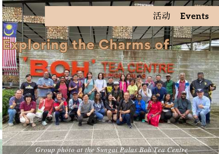
Group photo at the Sungai Palas Boh Tea Centre

The next day (October 25th), our tour guide had several destinations planned. Our first stop was Kea Farm, a farmers' market where we indulged in purchasing fresh local produce. Next on the agenda was the European-inspired Lavender Garden. We then visited the famous BOH Plantation in Sungai Palas, perched on a hill, offering a panoramic view of lush greenery. After enjoying home-grown tea and pastries at the cafe, we explored the Bee Farm, sampled different kinds of honey, and had lunch at a nearby shopping complex.