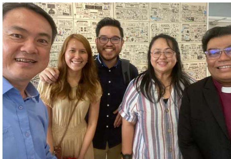
26 November 2023 - STM staff at Trinity Methodist Church, Petaling Jaya promoting STM courses.