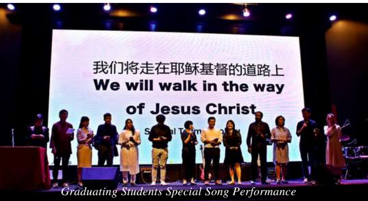
Graduating Students Special Song Performance