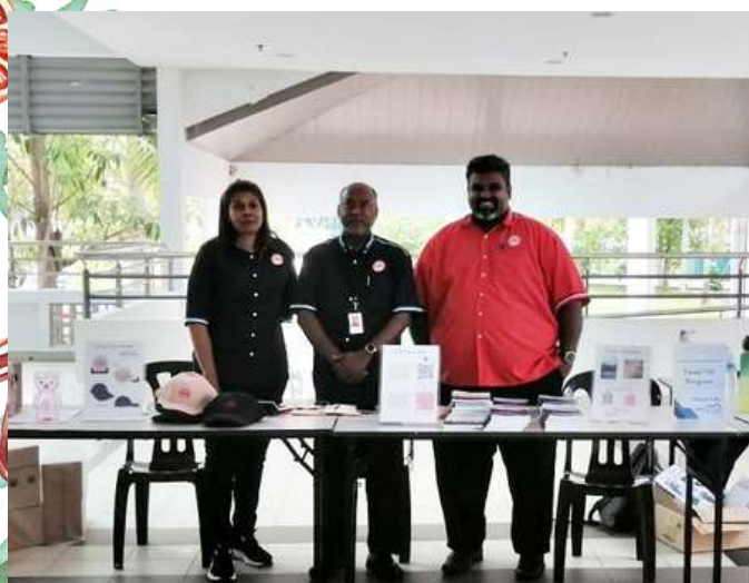
1 December 2023 - STM staff set up a booth at Tamil Annual Conference (TAC) held at Port Dickson Methodist Center to connect with TAC pastors and leaders and to promote STM Tamil TEE course.