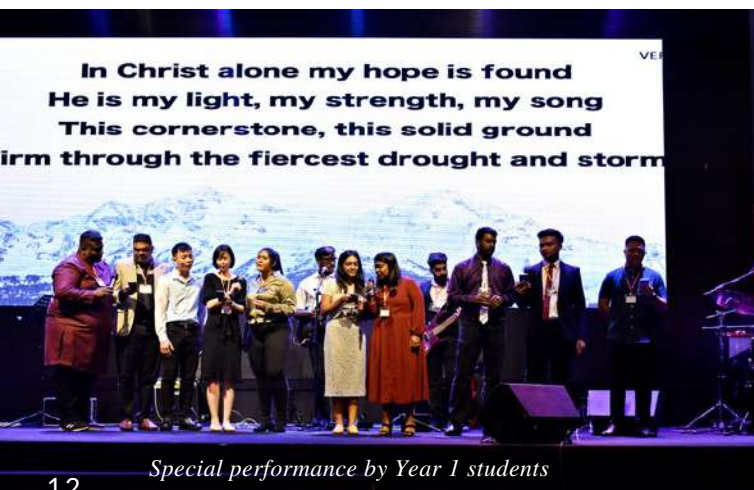
Special performance by Year 1 students