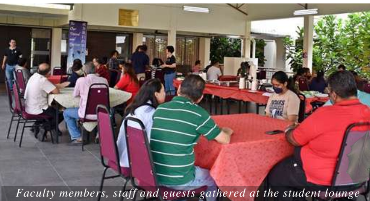
Faculty members, staff and guests gathered at the student lounge