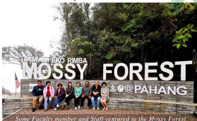
Some Faculty member and Staff ventured to the Mossy Forest

On the final day, after breakfast, some ventured to the Mossy Forest on a 4WD, a cloud forest filled with moss-covered trees. Others explored the local produce market for last-minute purchases.