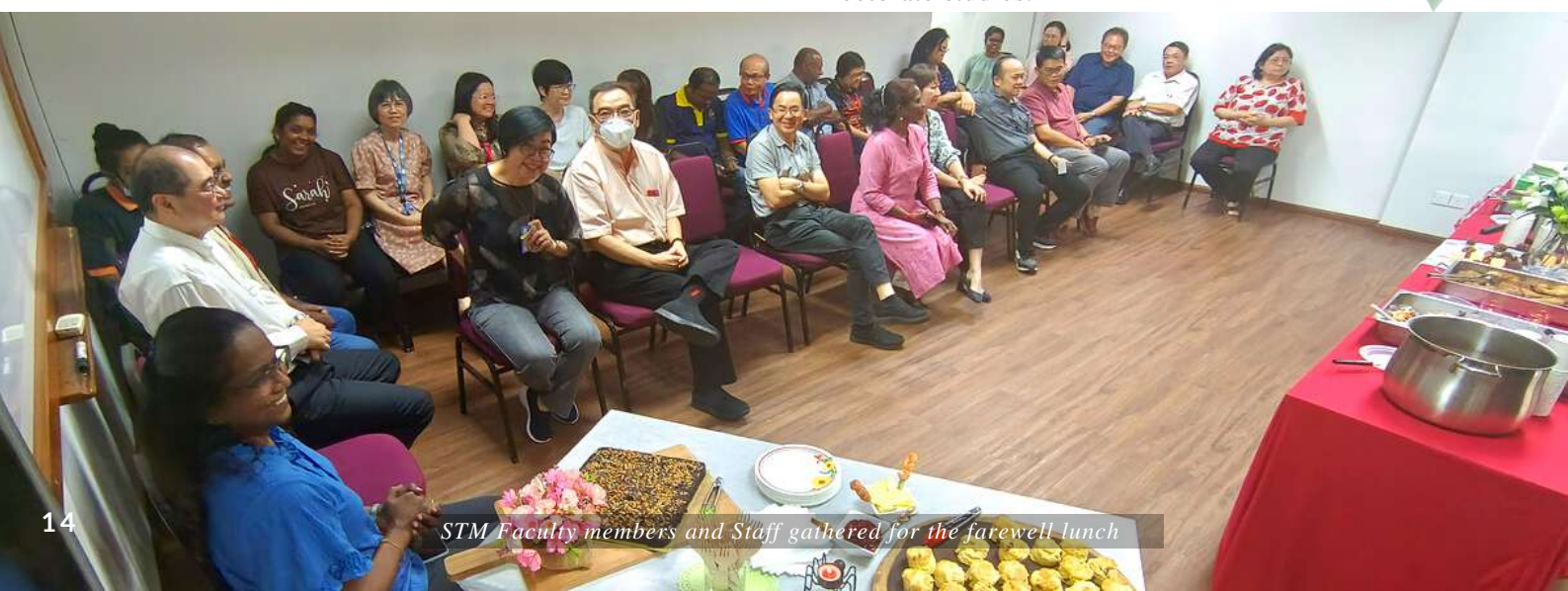
STM Faculty members and Staff gathered for the farewell lunch