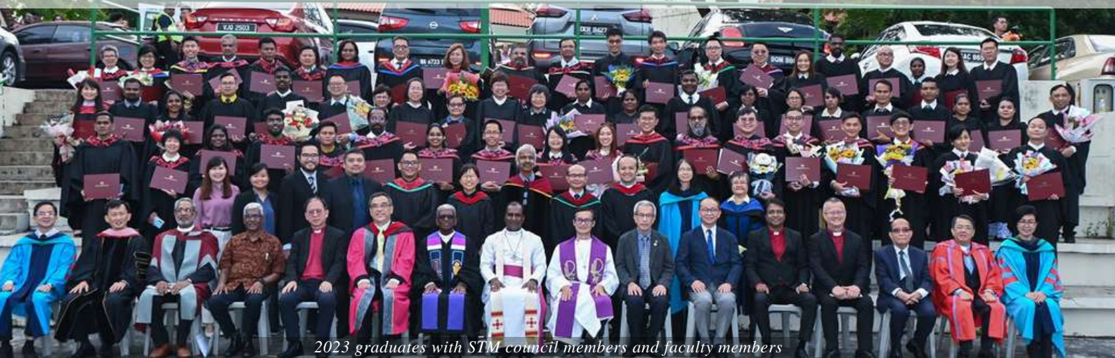
2023 graduates with STM council members and faculty members

The climax of each academic year is the graduation. The STM 41st Graduation Service 2023 was held on 21st Oct 2023. This year, 68 students graduated with various degrees. Some have endured 2, 3, or even 4 years of vigorous seminary training on a full-time basis. Others took longer as they studied part-time. One part-time student commented that it took her 17 years from certificate to diploma to her undergraduate degree. Thus, it was a day of joy, celebration, and thanksgiving.