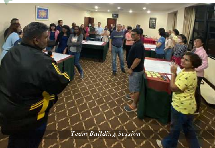
Team Building Session