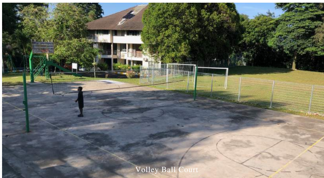
Volley Ball Court