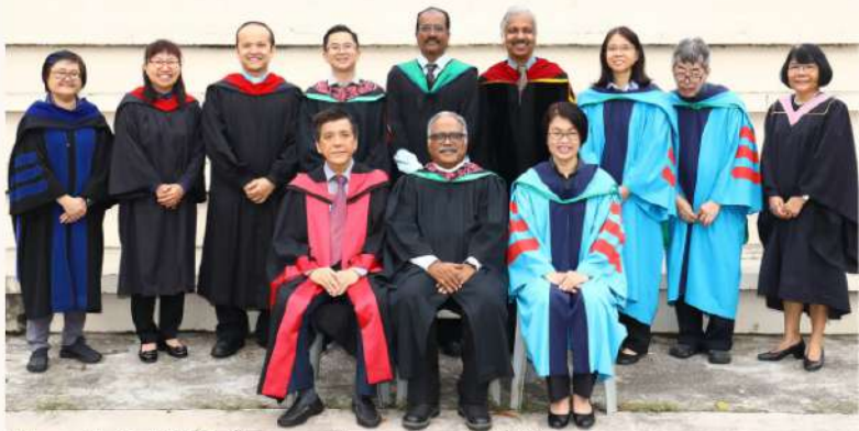
Faculty in STM Campus Seremban (2019)