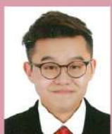
Low Kong Yi Anglican (DWM) DipCM (E)