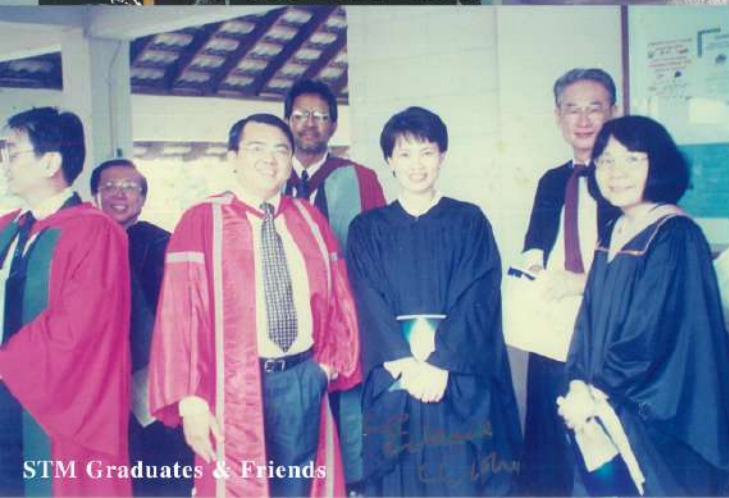
STM Graduates & Friends