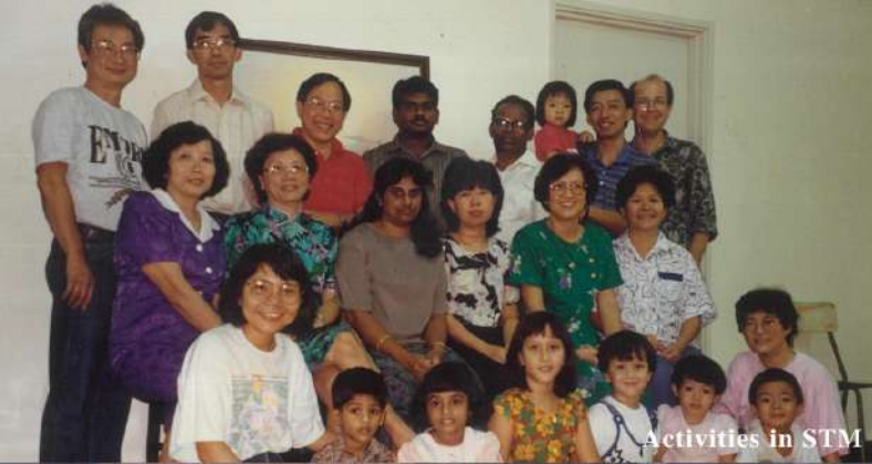
Activities in STM Mission Ministry