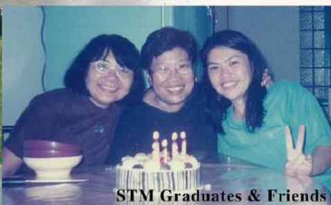
STM Graduates & Friends