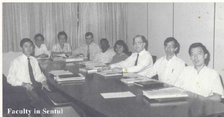
Faculty in Sentul

I have been blessed with kindness and generosity from so many. I appreciate the help with the technical stuff that I take so long to pick up, the offer of rides, the food that many cooked or baked, sent or ordered to be delivered, the invitation to share in meals, the kind thoughts and advice expressed in cards, flowers and gifts. I am ever grateful to the alumni. Many have hosted me in their homes, taken me for “jalan-jalan” and “makan”, and showed their concern in practical ways. I consider them blessings in the journey. I have also carried home after my visits with them pineapples, durians, mangoes, rice, noodles, pepper, cakes, and the list can go on. I am greatly encouraged to see so many still faithfully serving God even though in difficult circumstances sometimes. For all of you, I will always be thankful and give thanks to God for.