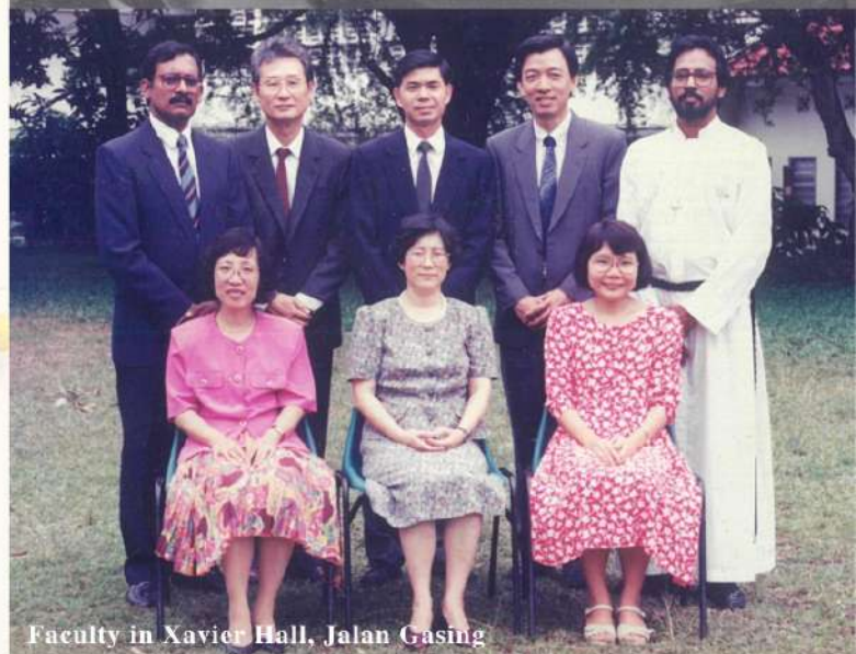
Faculty in Xavier Hall, Jalan Gasing