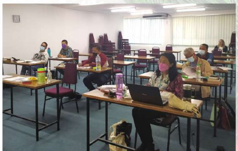
Webinar yang telah dilangsungkan pada 18 September.

Untuk maklumat lanjut berkenaan Program BM, sila hubungi Encik Ram Bin Buraat melalui email ramburaat@stm2.edu.my atau bmtee@stm2.edu.my . Anda juga boleh melayari laman sesawang STM di www.stm.edu.my/bm