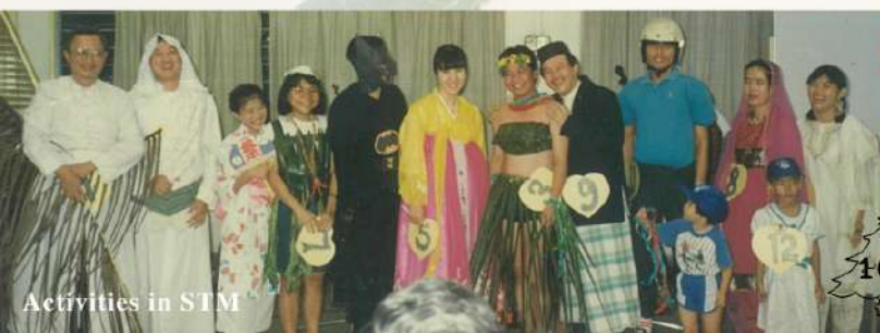
Activities in STM