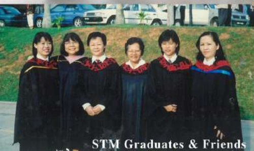
STM Graduates & Friends