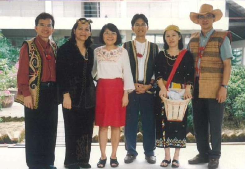
STM Graduates & Friends