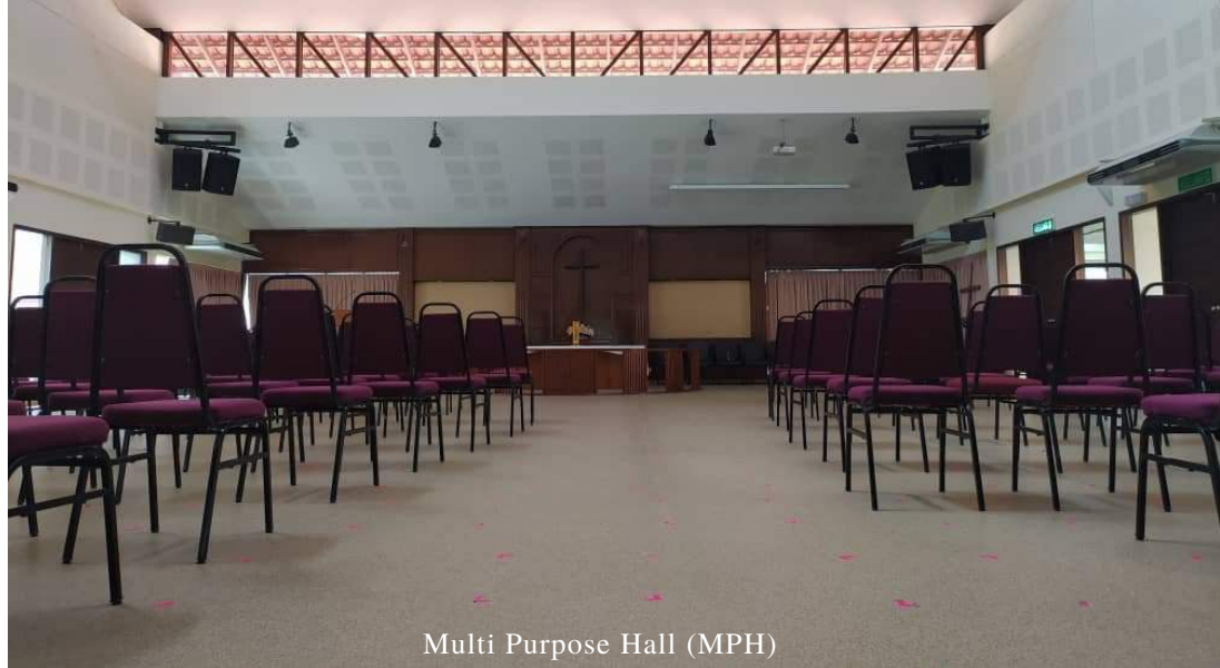
Multi Purpose Hall (MPH)