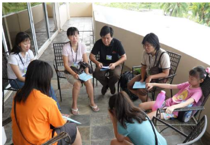
A prayer session before the youth camp in Kota Kinabalu.