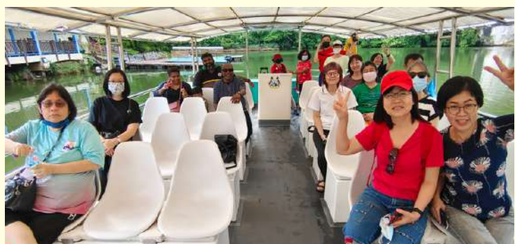
Boat ride to Gunung Lang Recreational Park

Later, we were on our own for lunch. We left Ipoh at 1.30 pm and reached our home at 6.00 pm. It was a memorable time for us as a family to be part of this trip. We would like to thank the Management of Seminari Theoloji Malaysia for organising this trip.