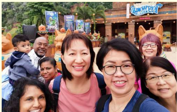
Lost World of Tambun

Next morning, we went for breakfast at the famous Foh San Dim Sum Restaurant just behind the hotel where we stayed. After that, we went to Gunung Lang Recreational Park. We were treated to a boat ride and visited the Mini Zoo. One thing that caught our attention was the “adventurous” group of monkeys at our back looking for food to eat. There were various kinds of animals in the Mini Zoo and my son and my wife had a good time there.