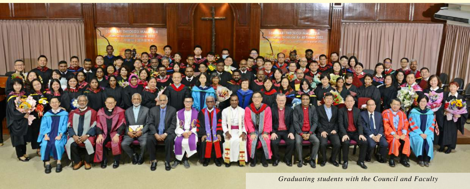
Graduating students with the Council and Faculty