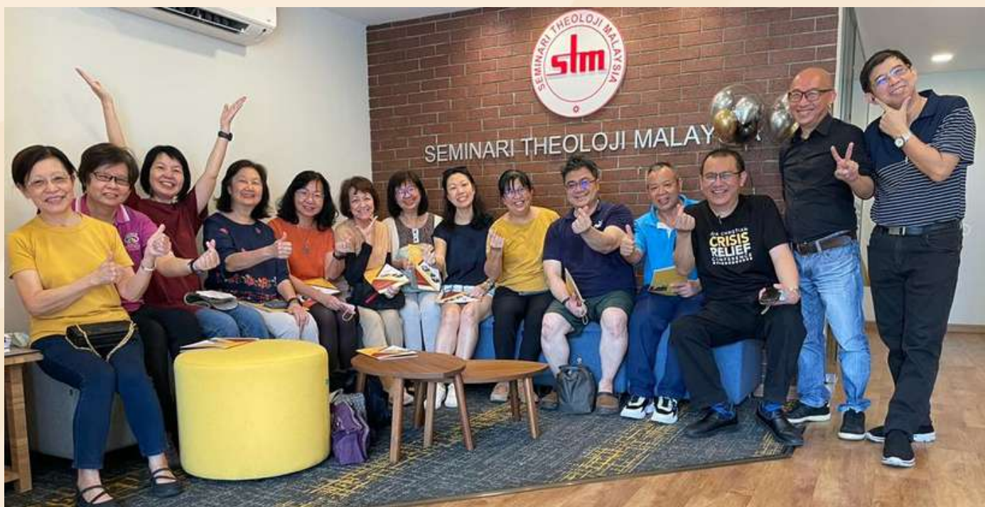
17 October 2022 - Walk to Emmaus members including those from East Malaysia and Singapore visited STM for camp site inspection and preparation.