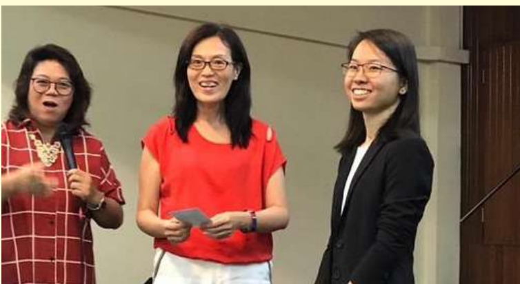
2018于实习教会的欢送会