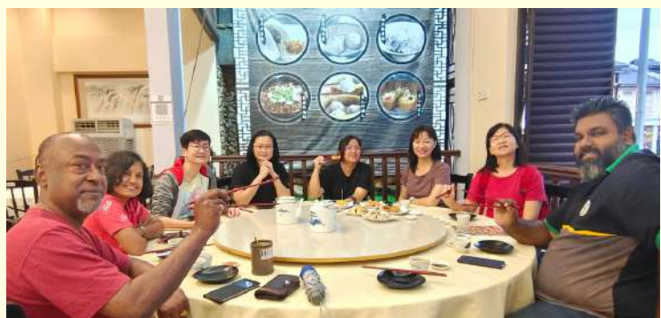
Breakfast at Foh San Dim Sum Restaurant

Next morning, we went for breakfast at the famous Foh San Dim Sum Restaurant just behind the hotel where we stayed. After that, we went to Gunung Lang Recreational Park. We were treated to a boat ride and visited the Mini Zoo. One thing that caught our attention was the “adventurous” group of monkeys at our back looking for food to eat. There were various kinds of animals in the Mini Zoo and my son and my wife had a good time there.