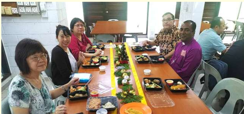
STM President, Principal and staff