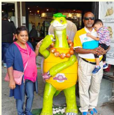
With wife and son at Gaharu Tea Valley

The date was set on 19 to 20 October. This time we were going to Ipoh, the land of lavish gastronomy. We were very excited as this was the first time we will be travelling to Ipoh as a family and I wanted to “experience” my son’s response to traveling in a bus.