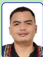
Jimbrie Jamiyuh PCS BD (E)