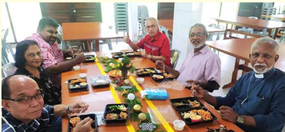
Council members and staff