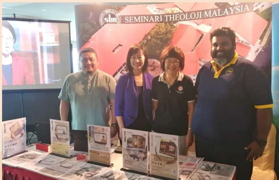
9 November 2022 - Promoting STM Micro-learning programmes at Chinese Annual Conference held at Ipoh Kinta Riverfront Hotel.