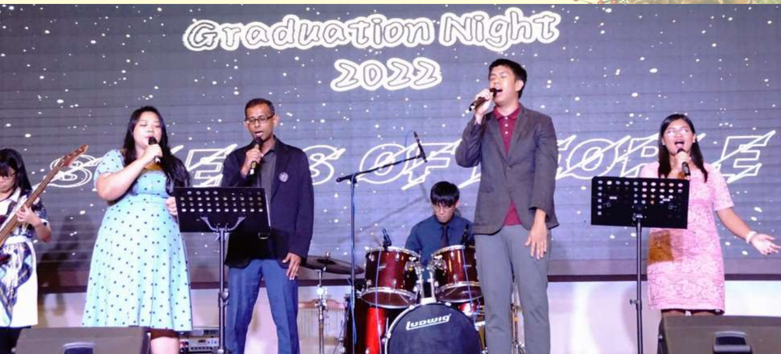
Praise and Worship led by Graduating Students