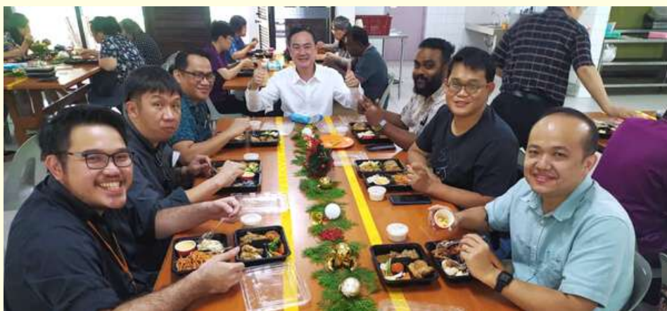
Faculty and staff