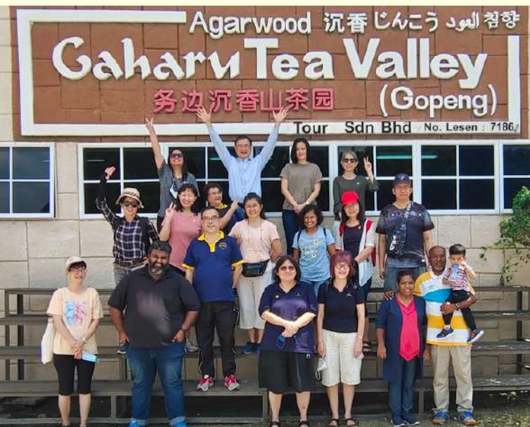
Group photo at Gaharu Tea Valley

We left STM at 7.30 am. It was a relaxing journey but I had to put up with my son’s attitude of the “I want to know more” response. The first place of visit was Gua Tempurung. Unfortunately, we were not able to go because it was closed due to a film shooting. Then we moved on to Hoga Gaharu Tea Valley. This was an interesting place that we visited. We had the opportunity to taste the tea leaves and had a good lunch in the cafe. Then we visited the tea valley. The next place to visit in the evening was the Lost World of Tambun. The places that we visited were very fascinating, especially the Night Safari. We were so thrilled to see the animals there and each place we went, we had a great moment of enjoyment. Though it was raining, we still managed to take a full tour of the Night Safari.