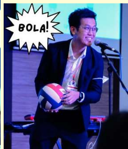
Performance by Year 2 Students