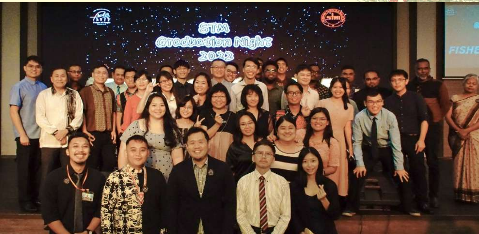
Group Photo of Graduating Students attending the Graduation Dinner

'Fishers of People', the theme for this year's graduation where the dinner was held at Min Kok Restaurant on the 14th of October 2022. It was an eventful day as everyone had an enjoyable time during the dinner. A team of students have been preparing for this important day since the beginning of the year. We planned on the theme, budget, flow of programmes and also the photo booth with a decorated background. Everyone worked their best in the hope to make the night a memorable one, especially for the graduating students and their friends, families, and guests. During the dinner, entertaining performances were presented and a photo booth was provided so that all guests could have their beautiful photos taken.