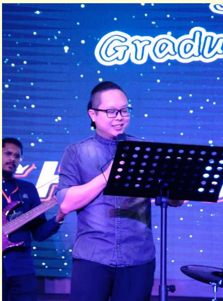
Graduation Theme Song Written and Performed by Students

The whole planning process from the start to the event day itself was interesting, fun, exciting and at the same time challenging for us as students. Nevertheless, it was a great experience for all of us. The only challenge that arose was that the dinner was to be held during the week when students were having their exams and rushing for the due dates of their assignments. By God's grace, all of us were able to overcome this great obstacle and the whole event was successfully done. A badge with the logo of the theme was designed and was also given as a door gift to all the guests present. Besides that, a theme song based on the given theme was also composed and presented during the dinner. Overall, the whole event was considered a successful one and our committee was glad that it made a good impression on the graduating students.